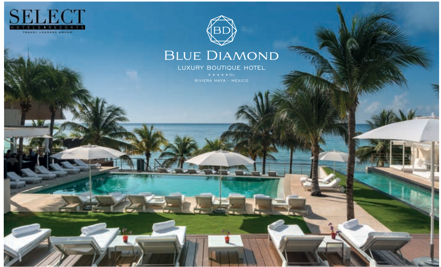
Blue Diamond Luxury Boutique Hotel*****GL Playa del Carmen - Quintana Roo, Mexico