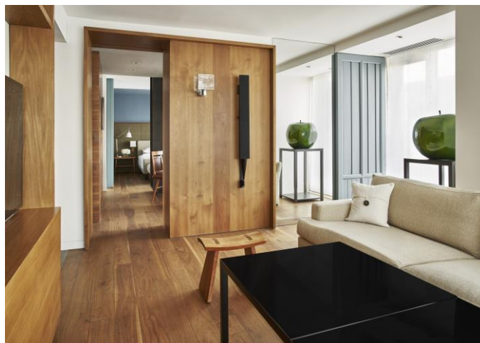
Located on the penthouse level, our Ambassador Suite, has a sophisticated style and residential feel.